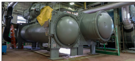
The oldest chiller in the Central Plant (top photo) compared to one of the new chillers (bottom photo).

that they no longer use R-22 refrigerant gas. After the newest chiller is fully functioning, the overall efficiency of the plant it is in will be improved by almost 12%. This not only benefits USF financially, but also ensures the air-conditioning system will be running better for a longer time. Along with these improvements that will impact everyone's environment, after the chiller replacement is complete, employees that maintain these chillers will be able to put all their effort into their day-to-day tasks and not have to worry about machines breaking down.