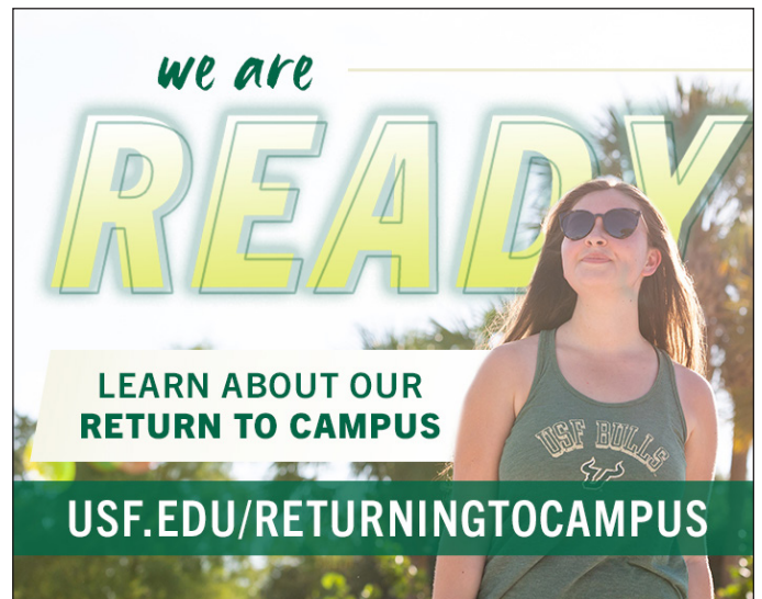
Visit the website above to find information on the process and steps the university has taken to be ready for the USF community to return to campus.