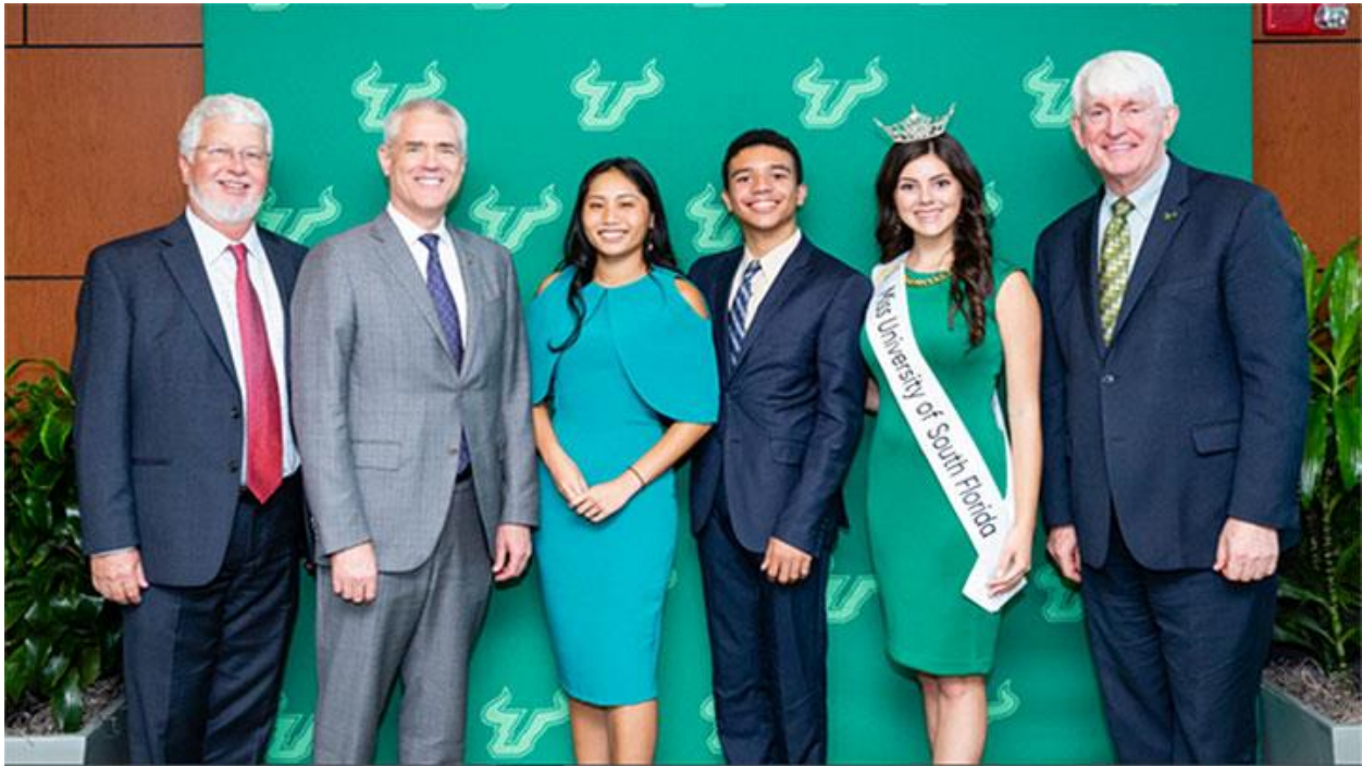
Photo taken at a PSP event prior to the COVID-19 pandemic.