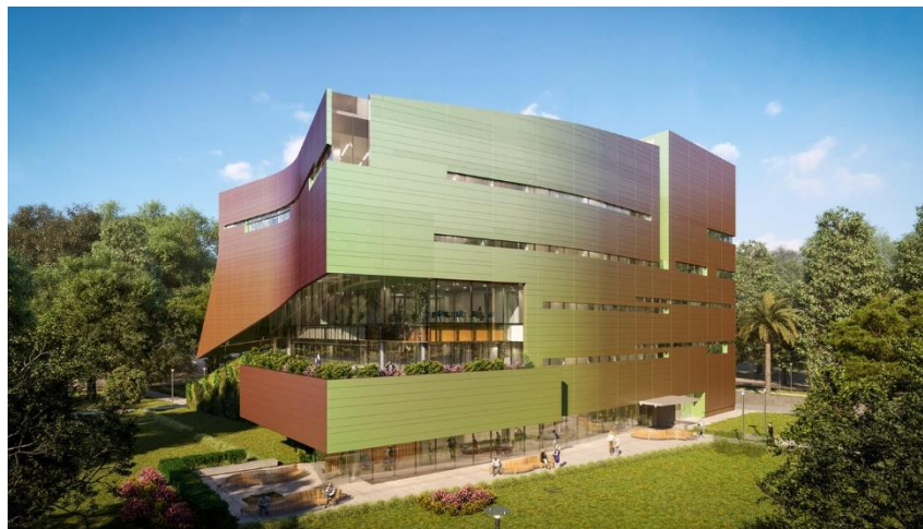
The new Honors building will offer a variety of classrooms and studios for Honors learning.