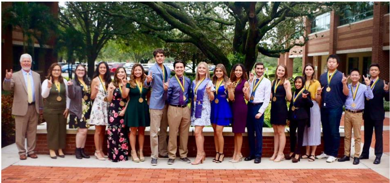
Honors graduation photo taken prior to COVID-19 pandemic.