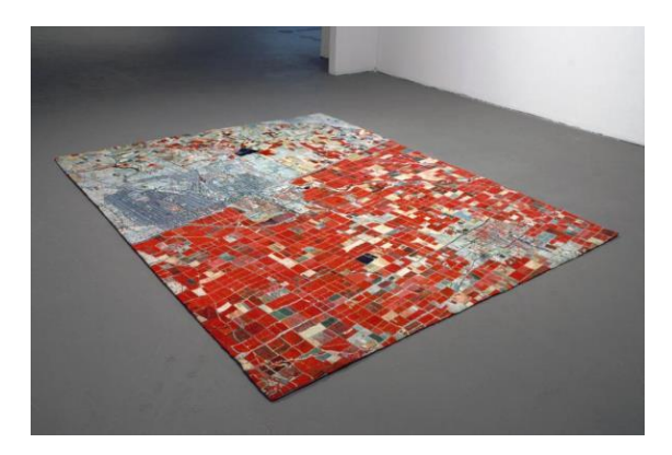
Ground Control (Mexicali/Calexico) 2007

I am seeking a CoTA Research Grant to facilitate the completion of Ground Control (Brownsville/Matamoros) which is part of an ongoing series of tapestries begun in 2007. Since 2007 I have made three of these tapestries, all of which have been self-funded, depicting images collected by NASA at places of conflict along the US/Mexico border; Mexicali/Calexico (2007), El Paso/Juarez (2010), and Colorado River Delta (2014).