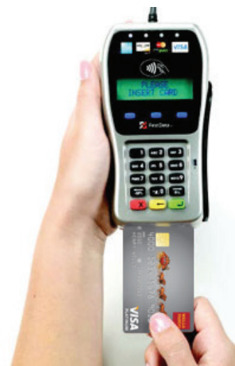
Sample POS device accepting EMV card.

Once EMV is turned on, it's easy to complete a purchase for a chip card. When you insert the card, the device will prompt for the entry of a tip, giving the customer the opportunity to enter a gratuity during the transaction. This is a requirement for EMV chip transactions. EMV transactions can't be adjusted for tips after the sale; tips must be entered during the sale. Also, in some EMV transactions the customer may be asked to enter their PIN.