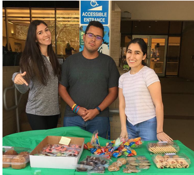
Criminology Club Bake Sale