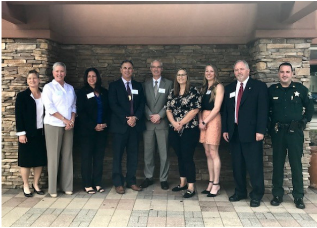
2019 Wall of Fame Inductees