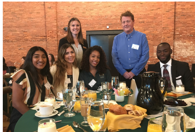
CBCS 10th Anniversary Breakfast Fundraiser