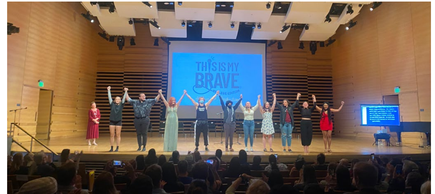
The cast of This Is My Brave – College Edition, A OneUSF Production bows at the end of the show.

The USF Center for Autism and Related Disabilities (CARD-USF) Autism Friendly team was recently recognized by Tampa City Council for its work to make Tampa a welcoming and safe community for individuals on the autism spectrum and their families. As part of the Autism Friendly initiative, CARD-USF has trained thousands of City of Tampa employees and other business professionals about autism, and provided specific strategies to help people on the spectrum be