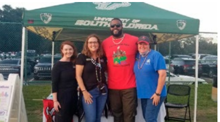
Donovan Smith & the CARD-USF team

Buccaneers offensive tackle Donovan Smith donated $10,000 to the Center for Autism and Related Disabilities [CARD-USF] this year. Smith, who has a nephew with autism, hosts an annual event that raises funds for the Tampa chapter of Autism Speaks. With this donation and other contributions made to the community, Smith hopes to help those with autism today and advance a spectrum of solutions for the future.