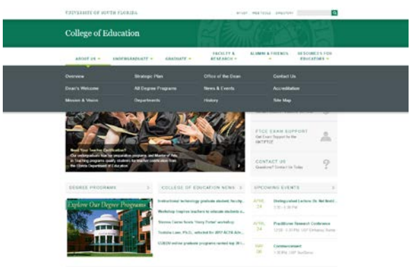
SCREENSHOT OF THE COLLEGE OF EDUCATION'S WEBSITE HOMEPAGE AFTER THE MODIFIED SITE NAVIGATION (WITH DROPDOWN MENU LISTINGS FOR 'ABOUT US' SECTION), APRIL 2017

Print Materials. This is an area of significant effort as there were no consistently designed digital and print materials in the College previously. In addition, renewed attention has been focused on social media. The College of Education's communications office has created numerous materials to promote the College's program offerings, and to provide faculty members and recruiters with a visual aid when speaking to prospective students.