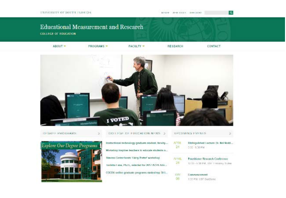
HOMEPAGE FOR THE COMPLETED EDUCATIONAL MEASUREMENT AND RESEARCH PROGRAM WEBSITE – APRIL 2017

A major concern with the former website was the difficulty surrounding intuitive navigation. This year, the communications office consulted with both Innovative Education and the University Communications and Marketing office to look at its current website sitemap and make revisions. By using drop-down tabs, the new site significantly reduces the number of page levels required to navigate. Tab options have been carefully designed to support easier movement through the site.