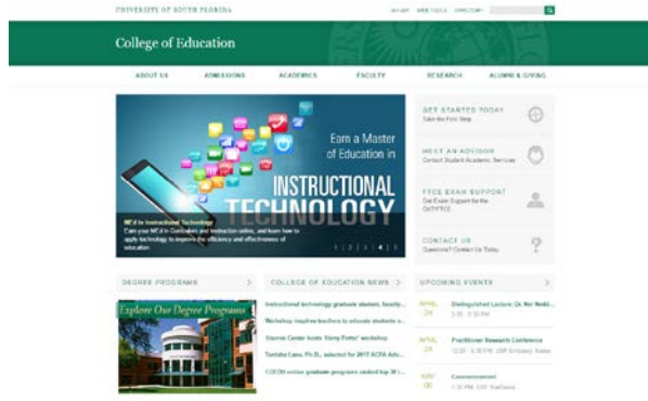
SCREENSHOT OF THE COLLEGE OF EDUCATION'S WEBSITE HOMEPAGE BEFORE THE MODIFIED SITE NAVIGATION, APRIL 2017