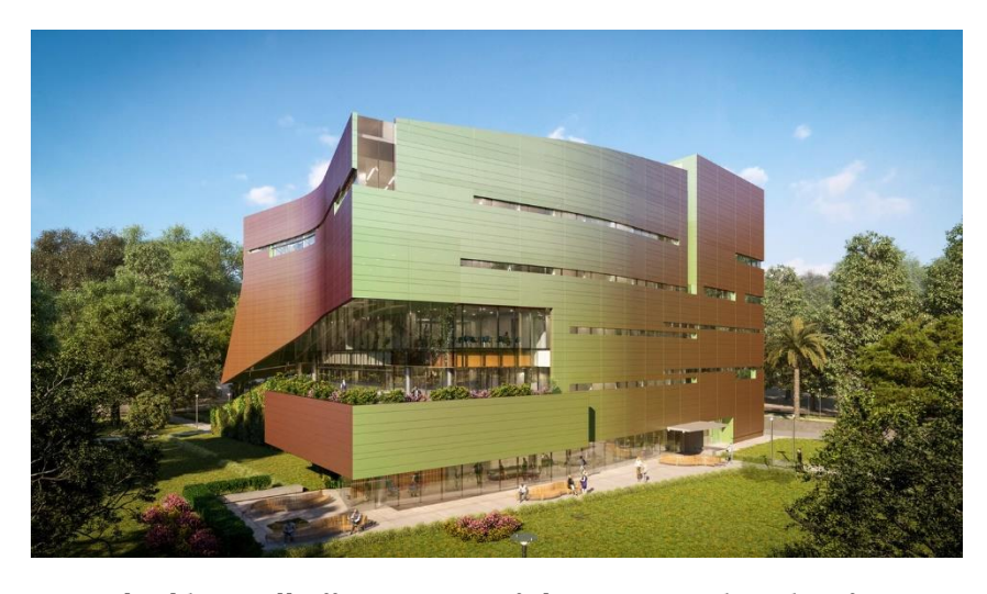
The new Honors building will offer a variety of classrooms and studios for Honors learning.