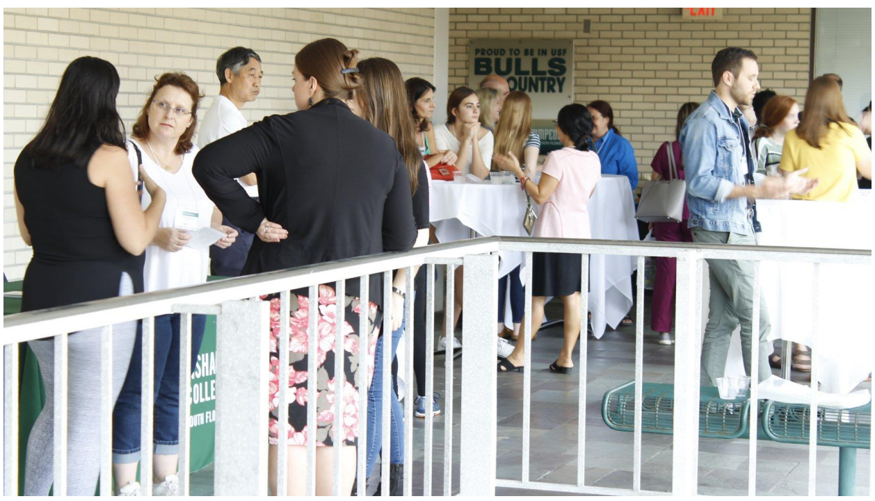
In the Fall of 2019 the College held multiple recruitment events.

During the 2019-20 academic year, approximately 403 students will graduate from the Honors College. Graduates continue to receive acceptances to the very best graduate and professional programs, nationally and internationally. They find employment opportunities within Florida and in major cities across the country. Honors graduates work in both the private and public sectors.