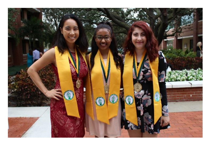
This year the College implemented the Dean's Circle of Merit to recognize students who went above and beyond in their leadership and service. Pictured here are three of four inaugural members at Honors College Commencement.