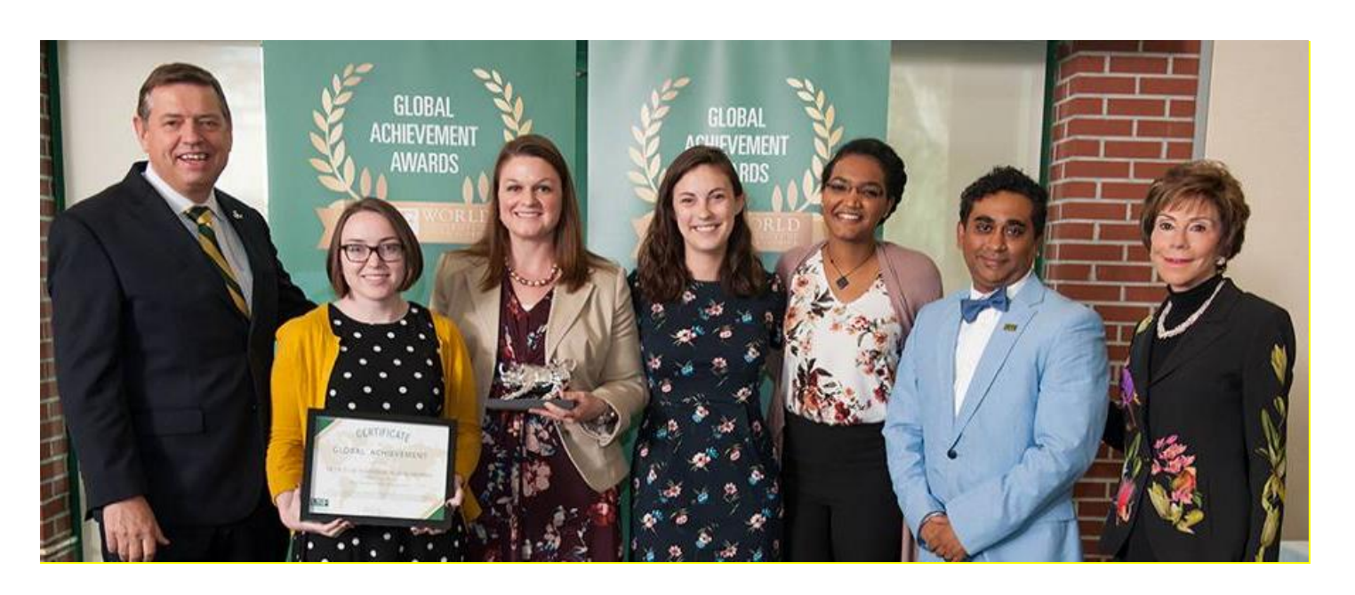
The ONS Team were recognized in 2018 at the USF Global Achievement Awards.

The Rangel Graduate Fellowship is a program that aims to attract and prepare outstanding young people for careers in the Foreign Service of the U.S. Department of State in which they can help formulate, represent and implement U.S. foreign policy. The Rangel Program selects outstanding Rangel Fellows annually in a highly competitive nationwide process and supports them through two years of graduate study, internships, mentoring, and professional development activities. This program encourages the application of members of minority groups historically underrepresented in the Foreign Service, women, and those with financial need.