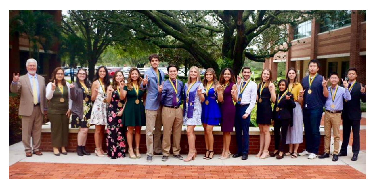
Honors graduation photo taken prior to COVID-19 pandemic.