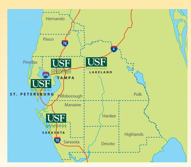
The USF System member institutions span the Tampa Bay region; however, true to their differentiated missions, the member institutions collectively provide educational services across the state of Florida and beyond

The University of South Florida System is a young and emerging system formed to bring its member institutions together to collectively serve the Tampa Bay region and beyond, resulting in a stronger presence and a distinctiveness that provides an unstoppable competitive differentiation. The USF System is tasked with finding ways to capitalize on synergies and economies of scales among its institutions that are of benefit to students. faculty, staff, alumni, and communities. As a solution for a metropolitan region of multiple major cities, the USF System is comprised of four members embodying distinct and differentiated missions: USF Tampa, the doctoral granting, research intensive member institution and three master's level institutions. USF St. Petersburg, USF Sarasota-Manatee, and USF Polytechnic. The first two institutions are separately accredited; the other two are in the process of becoming separately accredited.