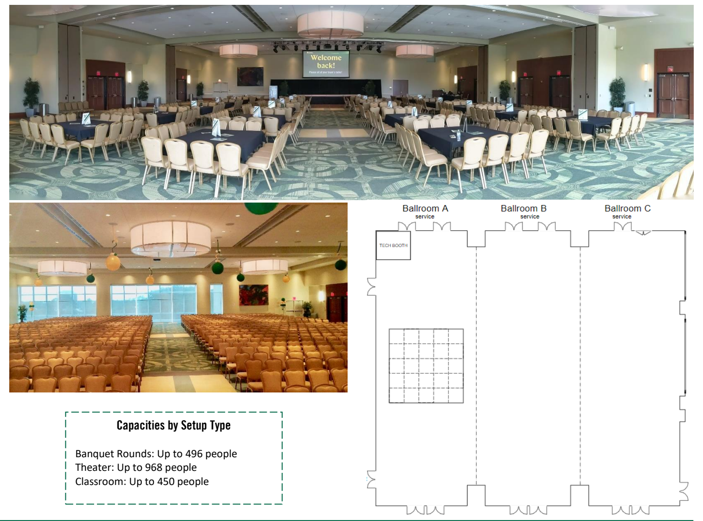
<u>See Building Floor Plan ></u> 10,281 sq. ft.