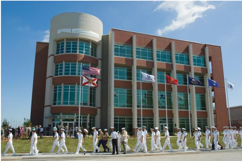
Buccaneer Battalion, University of South Florida