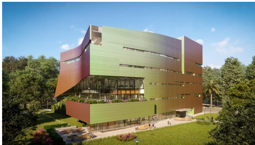
The new Honors building will offer a variety of classrooms and studios for Honors learning.