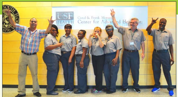
Members of the night shift Building Services team for the Morsani Center for Advanced Healthcare. They help keep the inside of this high profile building clean and well maintained for the staff, faculty, students, and patients that use it.