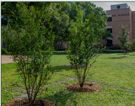
Two of twenty trees that were planted by the Campus Tree Advisory Committee during the month of April.

Being around trees has been proven to have many benefits, including reduced stress, lowered blood pressure, and improved mood; all of which lead to better overall physical health. With many people experiencing increased levels of concern about their health, now is a great time to celebrate our planet.