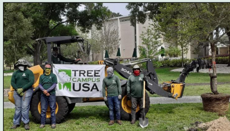
Members of the Campus Tree Advisory Committee planting trees to celebrate Arbor Day.

Earth Day was on the 22 nd of April and Arbor Day was on the 24 th . While festivities this year were limited due to the pandemic, the USF Campus Tree Advisory Committee still found a way to celebrate while following CDC guidelines. Twenty new trees of various species were planted on-campus. The act was commemorated virtually across USF's social media accounts. Planting new trees each year promotes a healthier environment by increasing biodiversity,