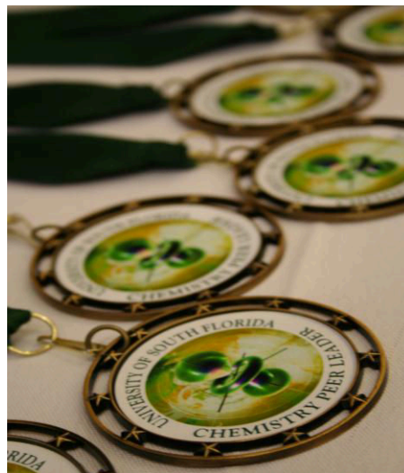
Close-up of medallions given to Peer Leaders or Honor Roll recipients

There are now about 20 named awards or scholarships, e.g., the Dr. Jesse S. Binford General Chemistry Award. Recipients received an appropriate book, as well a trophy and a scholarship ($200 or 250).