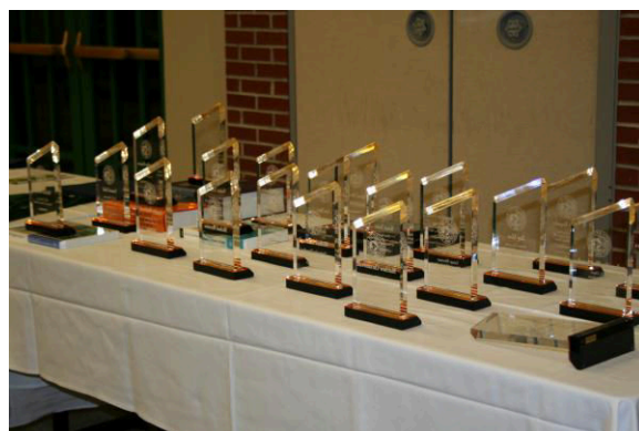
Trophies that were presented for the first time this year to scholarship and award recipients.