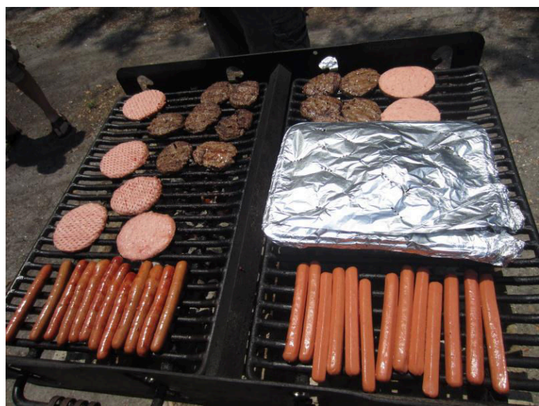
And look what was being grilled!