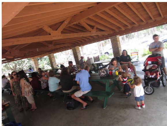
Some of the sixty persons present

The sixty persons present could take full advantage of the beach, playgrounds, boat ramp, and nature trails.