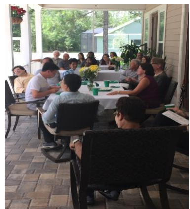
Most were able to attend

Understandably, not every faculty member was able to attend, but a majority were and enjoyed themselves in a relaxing, congenial environment.