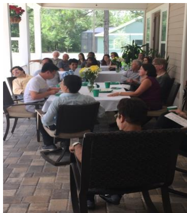
Most were able to attend

Understandably, not every faculty member was able to attend, but a majority were and enjoyed themselves in a relaxing, congenial environment.