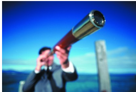
Promote an efficient entry-level workforce in Tampa Bay

Organizations hosting interns benefit by having active and enthusiastic members of the workforce who are acquainted with the most recent practical tools and