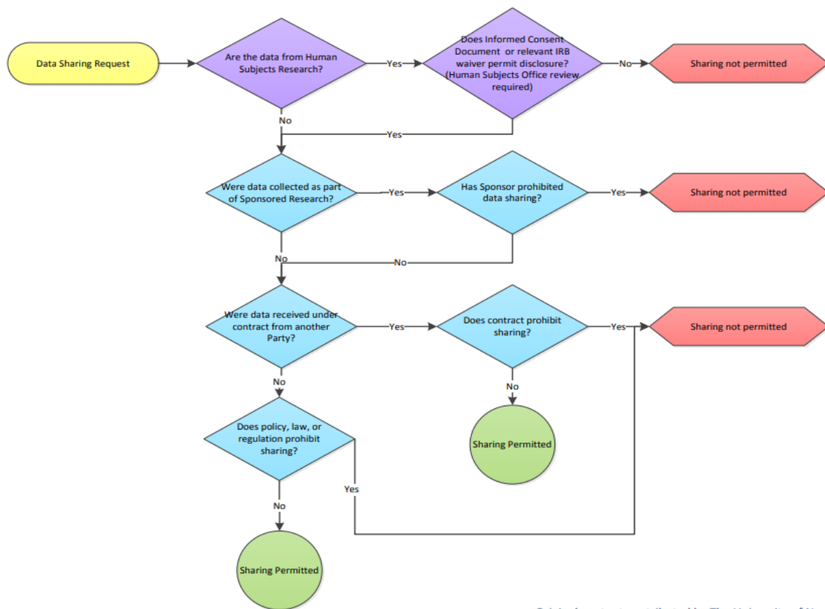
Exhibit A: Is data sharing permitted?

Original content contributed by The University of North Carolina at Chapel Hill. Used and adapted by the University of South Florida with permission.