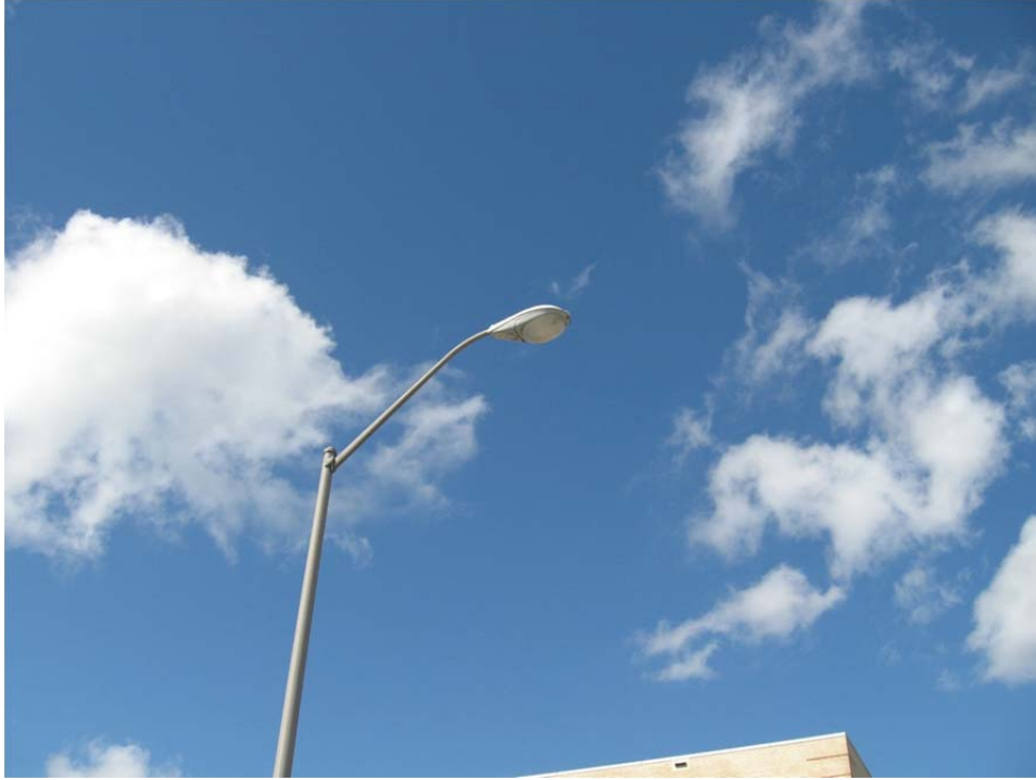
Typical Campus Cobra Head, High Pressure Sodium, Light Fixture