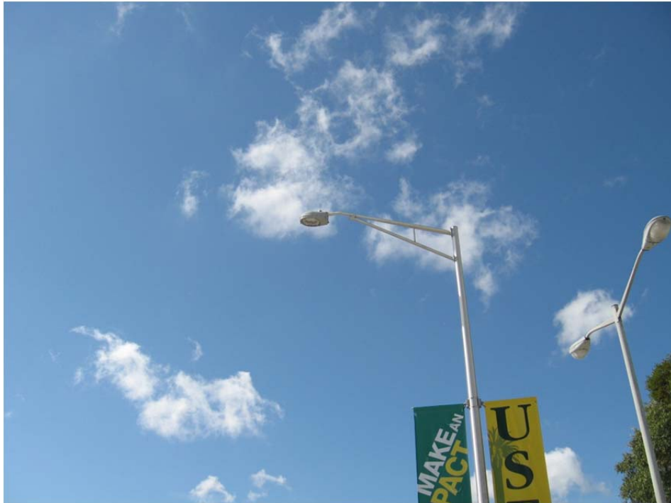
Example of LED Cobra Head Fixture (Magnolia Drive & Hawthorn Drive) (example of alternate manufactures that may be considered)