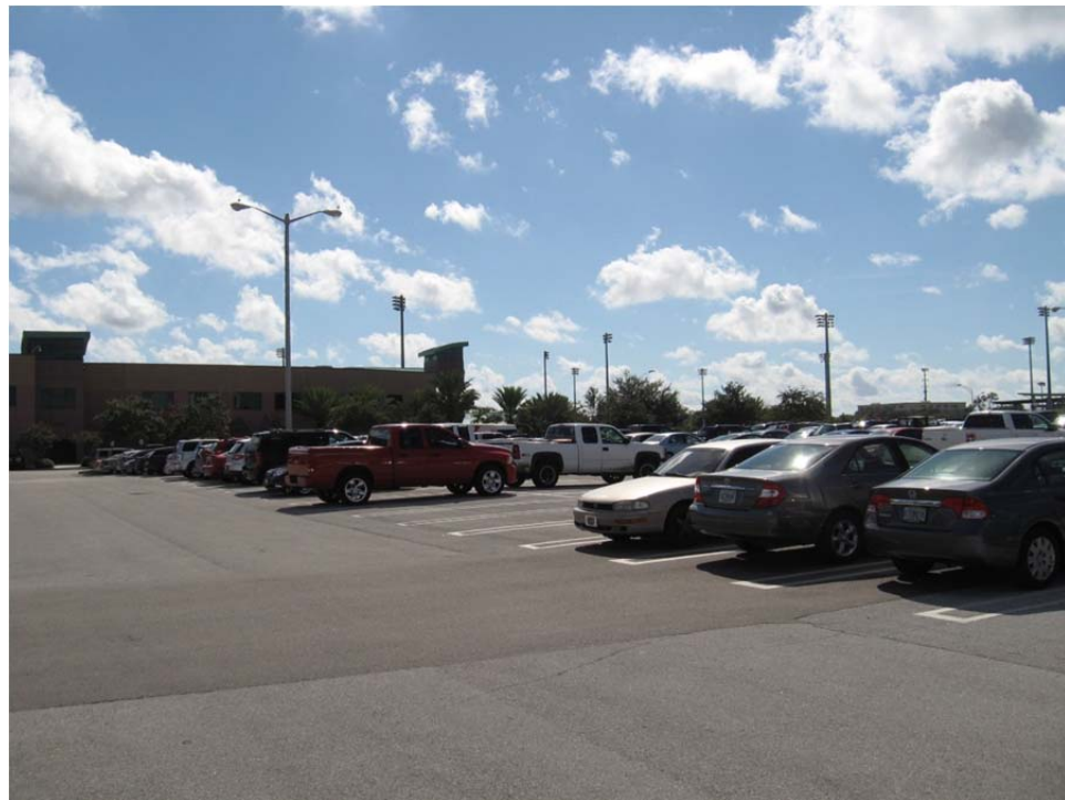
Parking Lot 6 – Southeast View