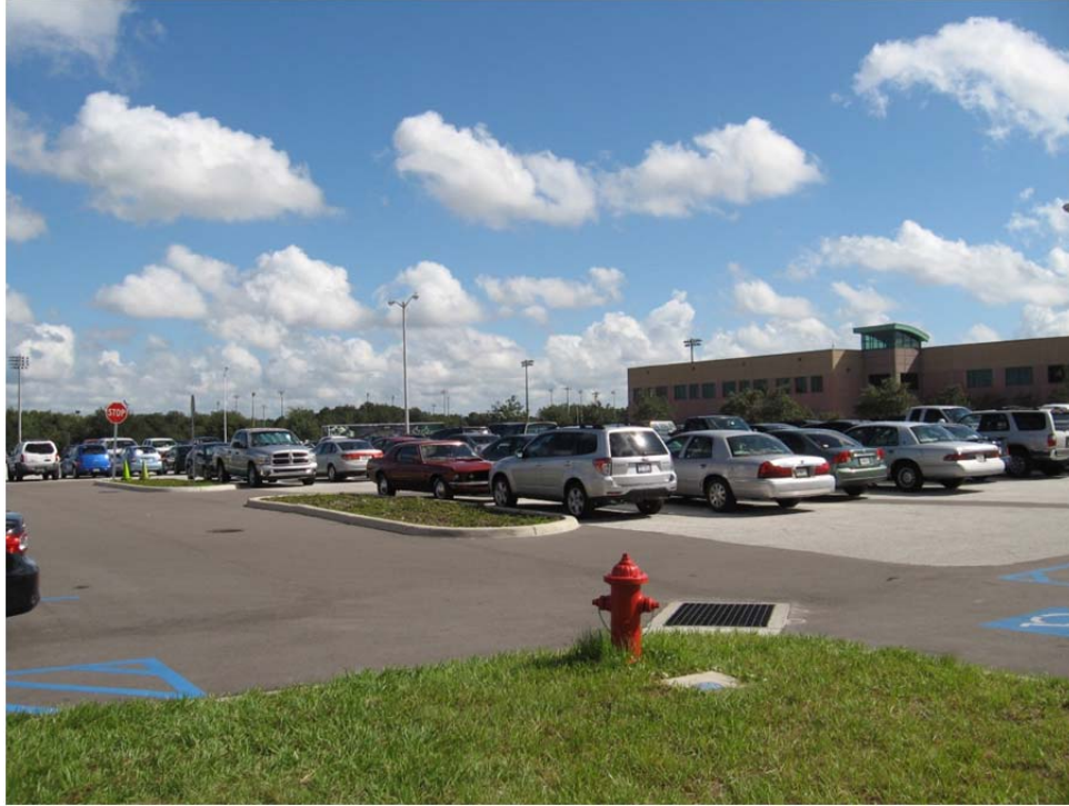
Parking Lot 6 – Northeast View