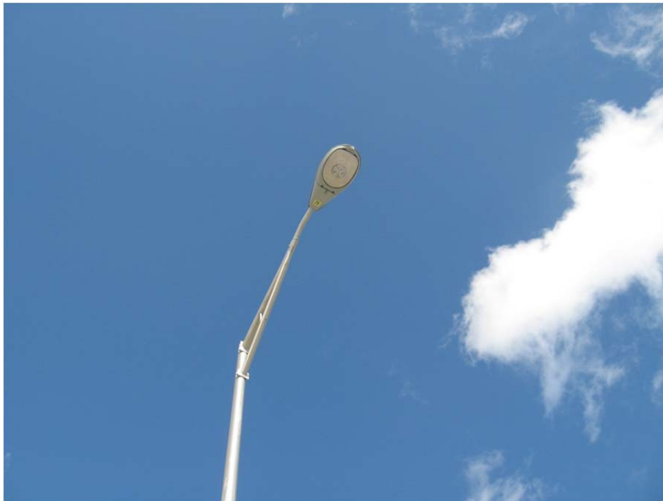
Example of Cobra Head LED Retrofit Unit (Holly Drive and West Entrance to CPT)