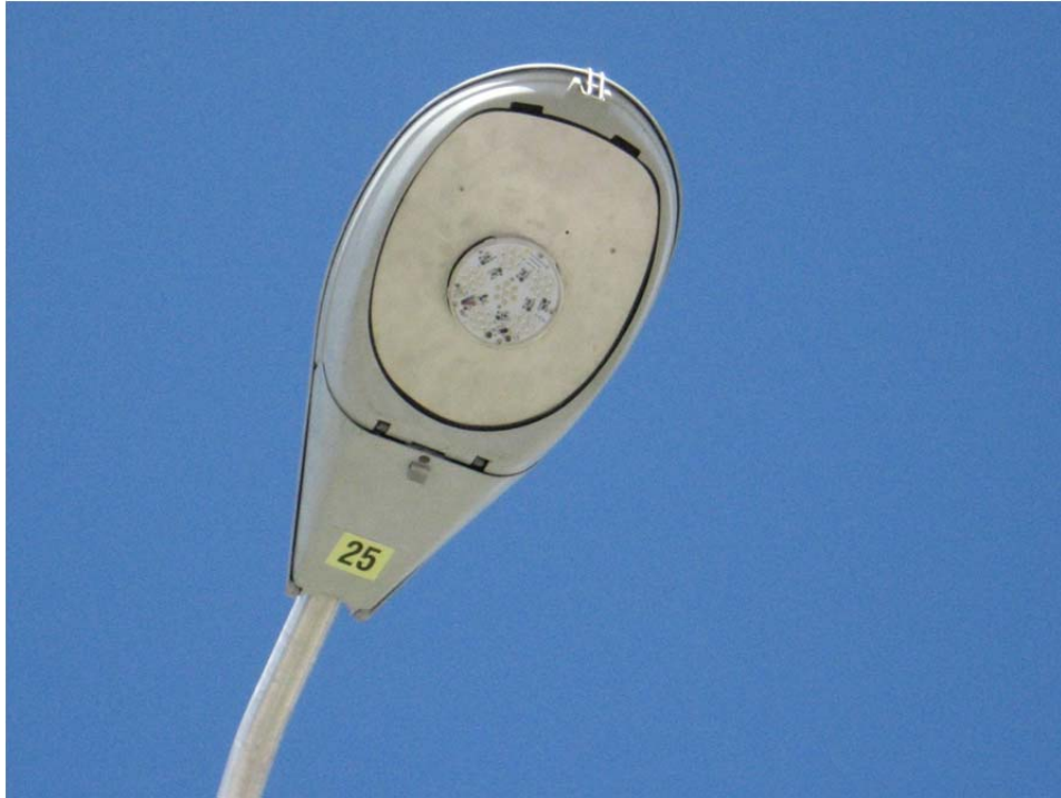
Close Up View of Cobra Head LED Retrofit Unit