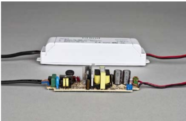
FIGURE 1. EXTERNAL DRIVER

Light emitting diode (LED) are characterized by low current and low energy consumption which makes them suitable for large types of applications. When used for lighting, they consume less energy without compromising much on the lighting levels. LED lights additionally have much longer life than ordinary bulbs (Sperber et al., 2012). LED's are a semiconductor device that emits light in a different way than incandescent or fluorescent bulbs. LED lights need lower voltage, and thus, the driver or ballast provides reduced voltage across the bulb. As LED are semiconductors, thus they offer negligible resistance and thus they are efficient and produce lower heat as well. This, in turn, results in lower cooling loads in the buildings with LED lights.