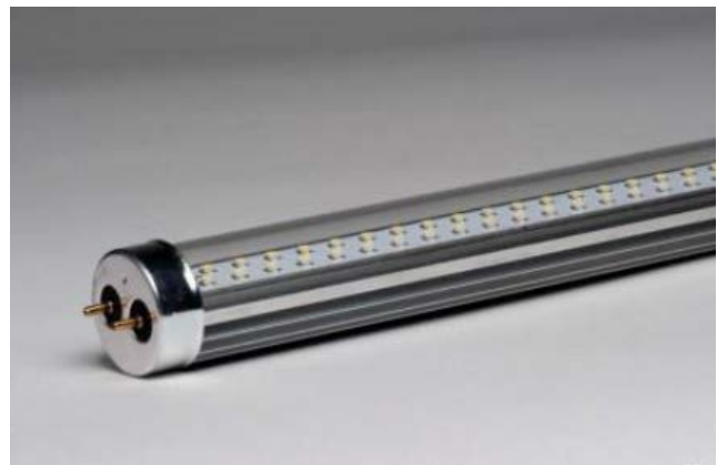
FIGURE 2. LED TUBE