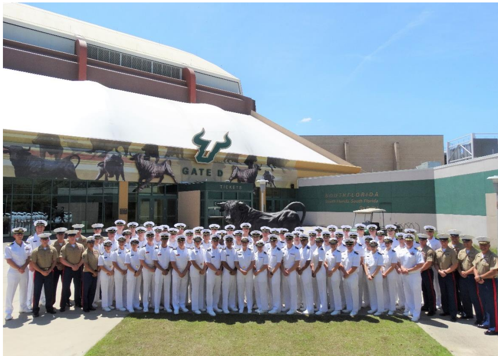
USF CLASS OF 2015-2016 BATTALION PHOTOGRAPH