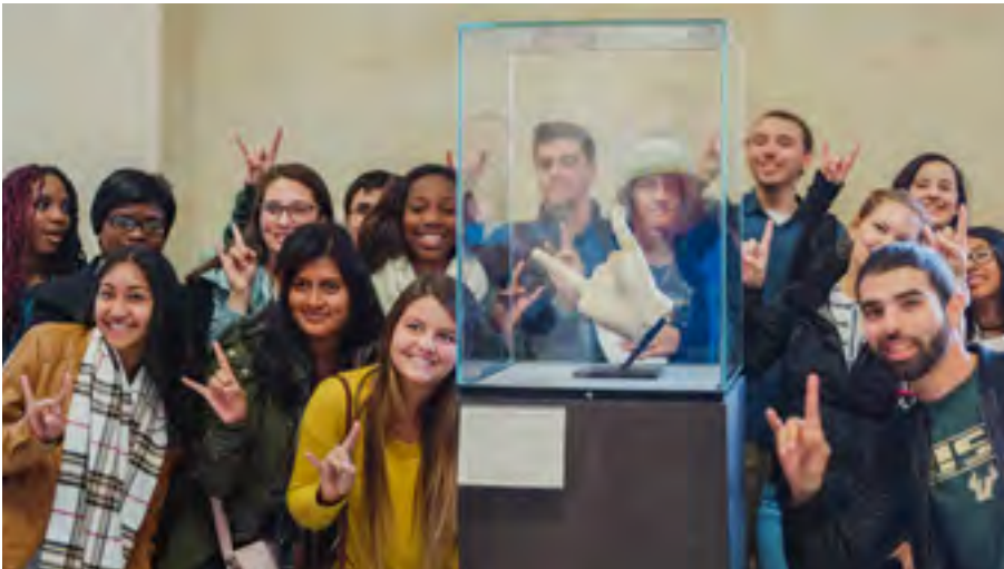
USF Bulls at the Louvre Museum, Paris, France.