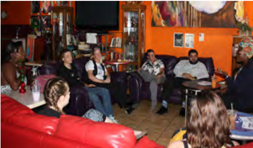
USF's Peace Corps Ambassadors at The Boba House for a Story Slam.

Peace Corps and the University of South Florida announced a new partnership centered on an undergraduate program called Peace Corps Prep. Students who join the Peace Corps Prep program will combine targeted coursework with hands-on experience, building the competencies needed to be strong Peace Corps volunteers or other international development specialists.