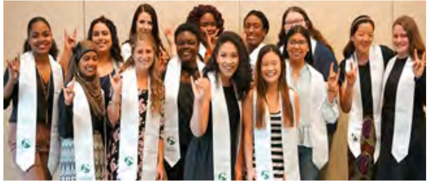
USF's GloBull Ambassadors Spring 2018.