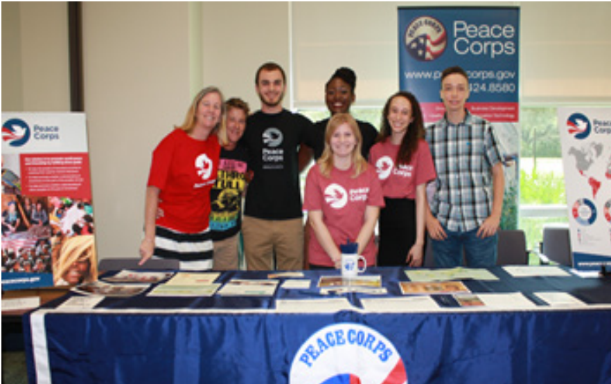
USF's Peace Corps Ambassadors.

The Peace Corps provides an unparalleled opportunity to learn about other people, develop language and career skills, and help improve the quality of life for people in developing countries. The goals of the Peace Corps are to promote peace and stability through education and training; foster understanding of other peoples among Americans; and enhance other peoples' understanding of Americans.