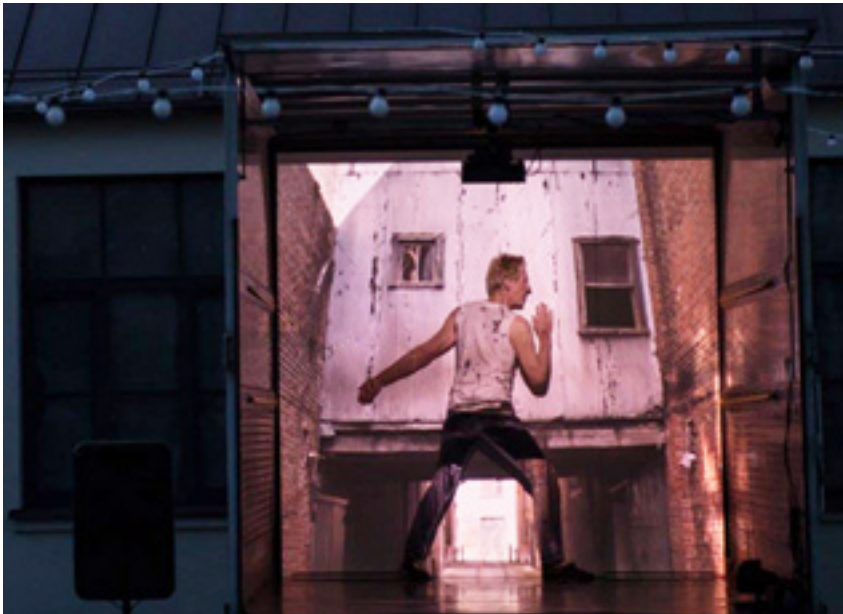
Bridgman | Packer Dance performing TRUCK at the New Baltic Dance Festival in Lithuania through USArtists International 2017.